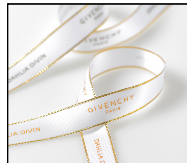
Lurex edges satin + screen printing