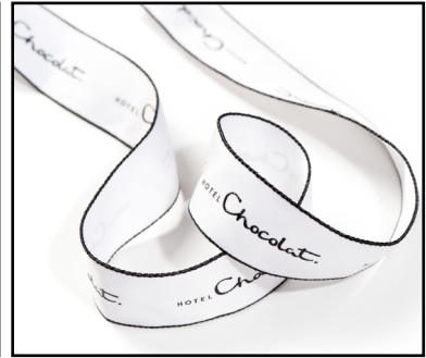
Matt polyester cotton look satin