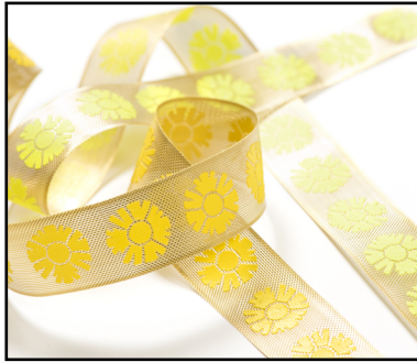
Lamé lurex ribbon + raised printing