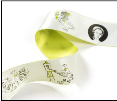
Sublimation transfer back printing + Offset printing