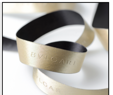
Lurex satin + sublimation transfer back printing + raised hot foil printing