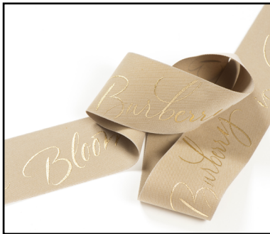
Recycled polyester gabardine ribbon + raised hot foil printing