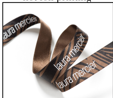
Single colour printed satin + raised screen print