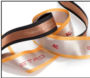
Bi-material ribbon viscose stripe and polyester gros grain + raised hot foil printing