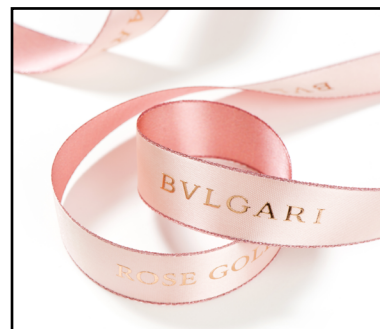
Lurex edges satin + sublimation transfer back printing + raised hot foil printing