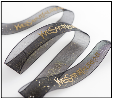
Organza ribbon + raised hot foil printing