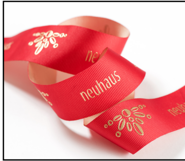
Double face sublimation transfer printing + raised hot foil printing